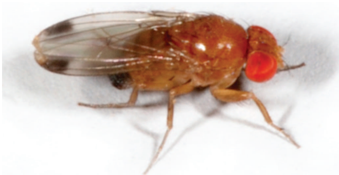
Fig. 2. Adult male; note dark spots on wing tips.

They have black stripes on the abdomen and males have a distinguishing dark spot on the leading edge near the tip of each wing. The spot may play a role in courtship but results are ambiguous for flies under diurnal light cycles (Fuyuma 1979). The female's serrated ovipositor (Fig. 3) is able to penetrate the skin of most thin-skinned fruit, leaving a small depression, scar, or "sting" on the fruit's surface (Fig. 4). A female lays \approx 1\text{--}3 eggs per oviposition site, averaging 380 eggs in her lifetime. The number of eggs laid may depend on fruit maturity and eggs tend to be randomly distributed on cherry fruit (Mitsui et al. 2006). Multiple clutches of larvae are quite possible on