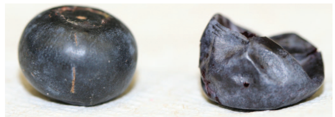
Fig. 5. Infested blueberry (right) exhibits soft, sunken areas two weeks after exposure to D. suzukii when compared with control blueberry (left).

Kanzawa observed that the fly oviposited most often on cherries, peaches, plums, persimmons, strawberries, and grapes in Japan, but